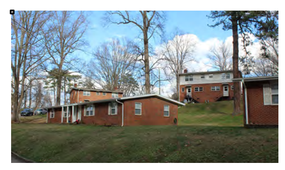
Figure 9: Southeastern Baptist Theological Seminary Duplexes (WA8692)

Southeastern Baptist Theological Seminary too expanded its housing during this time. In 1958, soon after their relocation to the Wake Forest College campus, the seminary began construction of twenty-five duplex apartments on a large wooded lot west of the campus and bounded by West Pine Avenue, Stadium Drive, Rock Springs Road, and North Wingate Street. The following year, construction began on fifty additional duplexes located on Stadium Drive, Judson Drive, and Rice Circle, about half of which were ready for occupancy for the 1959-1960 school year. In total, the two-part development included eighty-eight duplexes constructed from