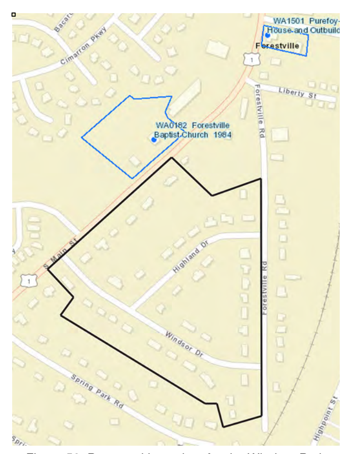
Figure 53: Proposed boundary for the Windsor Park Historic District

The period of significance extends from 1960, when the neighborhood was platted, to 1972, when the majority of the subdivision was built out. The boundary follows the 1960 plat of the subdivision, excluding later and altered houses in the 1400 and 1500 blocks of South Main Street.