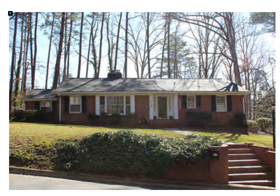
Figure 47: Boundary Increase Area D: 219 West Vernon Avenue (WA8745)