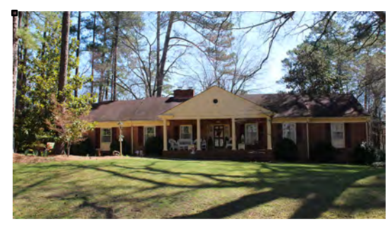
Figure 44: Boundary Increase Area A: 532 North Wingate (WA8760)

Northwest of the district is mid-twentieth century residential development along North Wingate Street, West Juniper Street, and Rock Springs Road. Houses are largely brick Ranch houses on large, wooded lots. While the area has a more suburban feel than the early twentieth century houses within the district boundary to its east, the streets laid out as a continuation of the existing street grid and setbacks are consistent throughout the area.