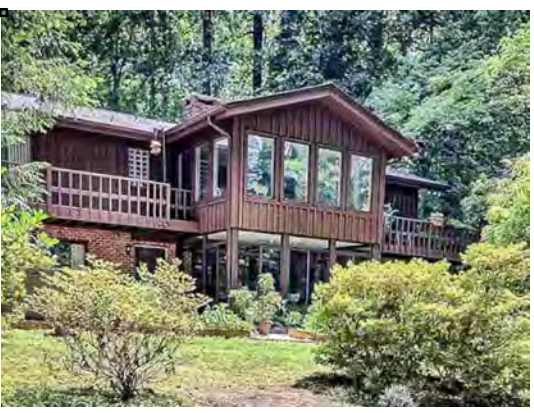
Figures 30 and 31: William and Barbara Mutschler House (WA8698) facing northwest (top) and facing southwest (bottom)

with the exception of the thirty-two-panel door with one-light sidelight and transom windows that extend all the way up to the roofline. The left (west) one-third of the façade is obscured by the shed-roofed, two-car carport. Tall, fixed windows and one-light French doors on the west gable end open from the dining room to a wood deck that wraps around the northwest corner of the building.