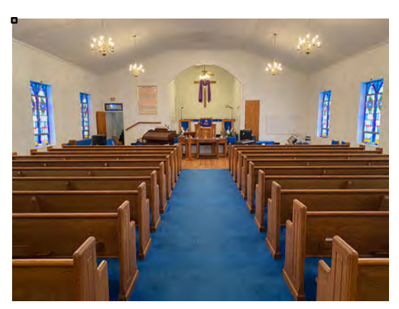
Figure 36: Olive Branch Baptist Church (WA8717) sanctuary facing south

The Olive Branch Baptist Church is also significant for its contributions to the Social History of the African-American East End neighborhood. The church, like most late nineteenth and early twentieth century African American churches, served as a community center, hosting community meetings and actively working to establish schools in the area. As noted in the 1869 deed, there was a Freedman's school associated with the church from its very early years. In addition to hosting a school associated with the church, members of the Olive Branch Baptist Church were instrumental in establishing a public school in the East End neighborhood in the 1920s. The first public school for African-American children was located across