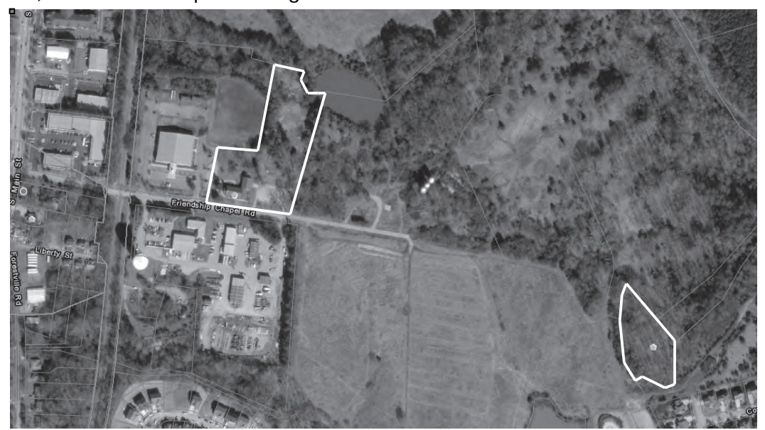
Figure 43: Friendship Chapel Baptist Church and Cemetery proposed boundary

A tentative Period of Significance that extends from 1929, the construction of the current sanctuary, to 1970 is proposed. However, if additional research during the nomination finds that the nineteenth-century cemetery and 1929 sanctuary have equal significance, an earlier POS that encompasses the earliest known graves, would be appropriate. The property meets Criterion Consideration A for religious properties because the property derives its significance from its association with the Religious and Social History of the African American community in Forestville, and not for its specific religious association.