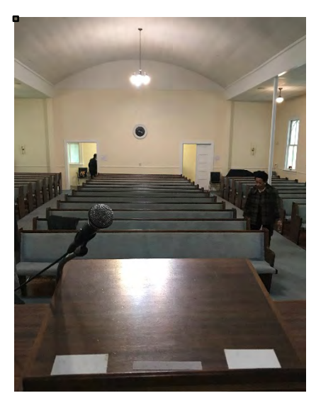
Figures 40 and 41: Friendship Chapel Baptist Church (WA1493) sanctuary facing east (top) and facing west (bottom)