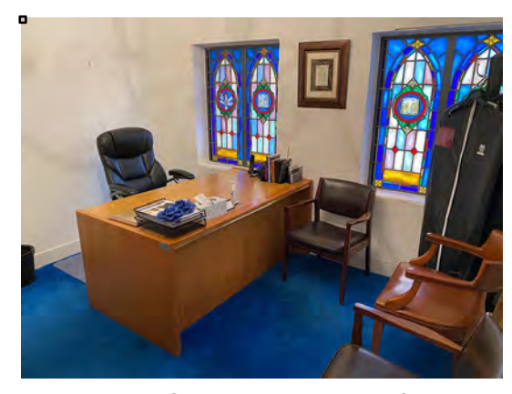
Figure 37: Olive Branch Baptist Church (WA8717) office facing southwest

The boundary should include the entire 2.02-acre parcel currently associated with the church, as well any portions of the associated cemetery that fall outside of that parcel. A tentative Period of