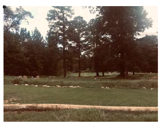
Figure 42: Friendship Chapel Baptist Church (WA1493) 20<sup>th</sup> century cemetery

The boundary should include approximately 3.9 acres of the larger 13.6-acre parcel currently associated with the church. The L-shaped tract includes trees that flank the front walkway to the church, the immediate surroundings and landscaping, and the twentieth-century cemetery