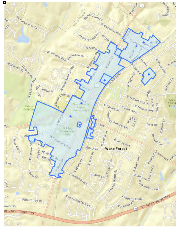
Figure 2: Wake Forest's National Register Historic Districts

The primary objective of the 2020 survey project was to expand the existing survey records to include resources constructed between 1958 and 1975. The survey documented both representative and outstanding examples of mid-twentieth century architecture. It also documented planned developments that were either platted or largely built between 1958 and 1975.