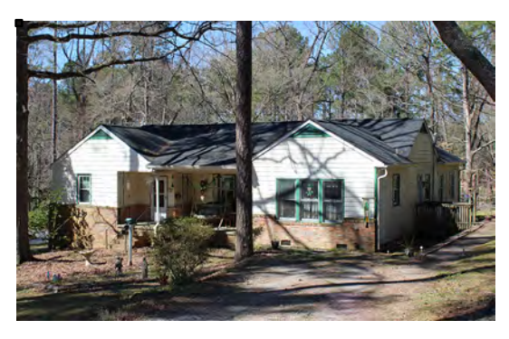
Figure 46: Boundary Increase Area C: 442 Woodland Drive (WA8732)

Like Boundary Increase Area A, the areas have a more suburban feel than the early twentieth century houses within the district boundary to its north and east. However, the streets are laid out as a