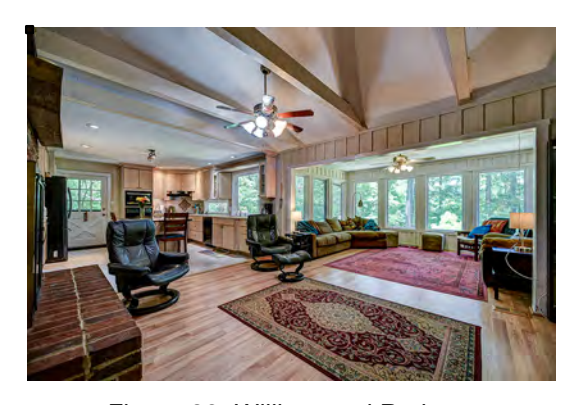
Figure 32: William and Barbara Mutschler House (WA8698) living room facing northwest

The exterior is landscaped with a circular concrete drive edged with plantings at the front of the house. At the rear of the house are brick patios, brick and gravel paths, and landscaped gardens overlooking a wooded area and the Wake Forest Country Club golf