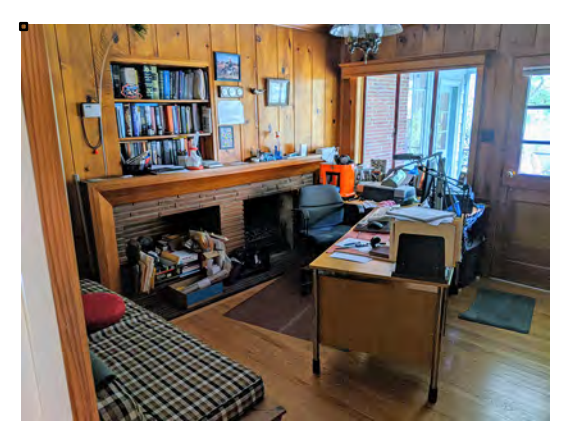
Figure 29: Thomas J. Byrne House (WA8734) den facing southeast

Byrne on September 9, 2007.<sup>114</sup> Byrne remained in the house until 1997 and remained in Wake Forest until his death in 2007.