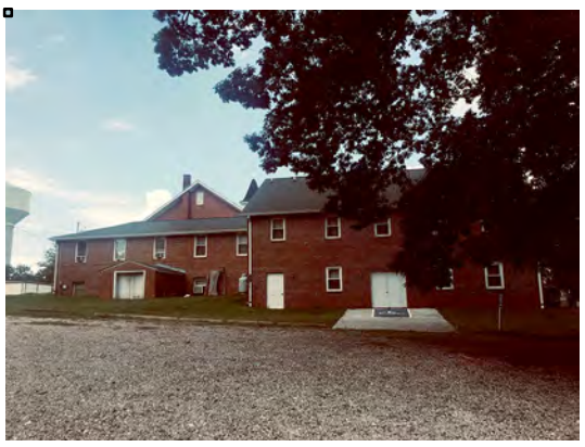
Figures 38 and 39: Friendship Chapel Baptist Church (WA1493) facing northeast (top) and facing west (bottom)

An early cemetery is located at the site of the brush arbor, on what was historically the Dunn family