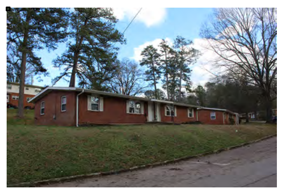
Figure 45: Boundary Increase Area B: Southeastern Baptist Theological Seminary Duplexes (WA8692)

Along the west boundary of the district, separated from the oldest part of the campus by several institutional buildings, is institutional housing, constructed the Southeastern Baptist bv Theological Seminary and the Paschal Golf Club, constructed by Wake Forest College. The collection of thirty one- and two-story brick duplexes was constructed from 1959 to 1975, to house the largely married student population and their families. The 1917 Paschal Golf Club is a significant landscape associated with the earlier college and the adjacent houses-within the Wake Forest Historic District and associated with faculty of the college-along Durham Road (NC98). Both resources illustrate the continued