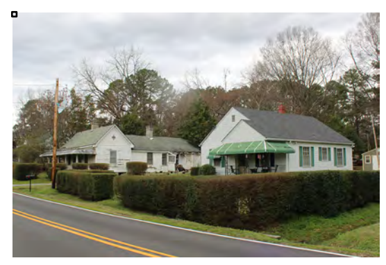
Figure 4: 215-303 East Juniper Avenue (WA4973)

Meanwhile, segregated African American community, now known as East End, formed after the close of the Civil War in the northeastern part of town, generally east of North White Street, north of Wait Avenue, and south of East Perry Avenue. This neighborhood was home to many of the town's formerly enslaved Black population, many of whom worked in town and at the college in positions as domestic servants or as laborers for the railroad, industries, mills, and shops. A Black commercial district formed on North White Street, adjacent to the white-dominated downtown, and included Joe Gill and Johnnie Hayes' pool room,