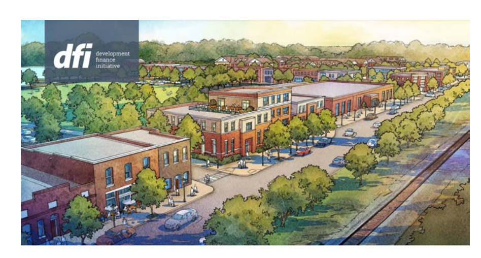
Town of Garner Downtown Opportunity Site

• Includes project details and specific Town requested preferences